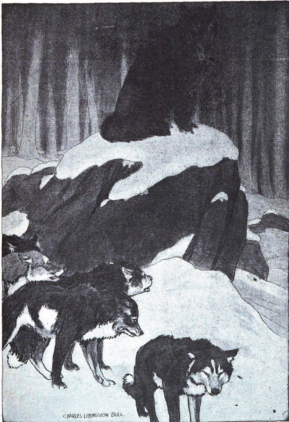
CHARLES LIVINGSTON BULL.

“To him, in appearance and action and impulse, still clung the Wild.”