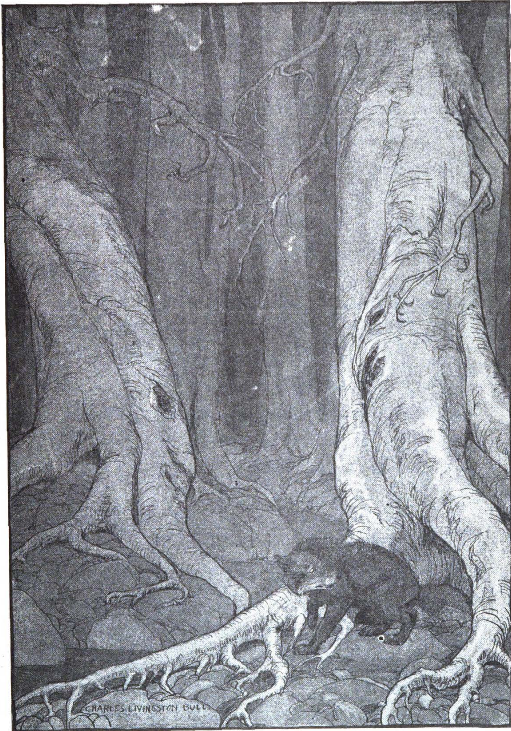
“He felt the lurking of danger, unseen and unguessed.”